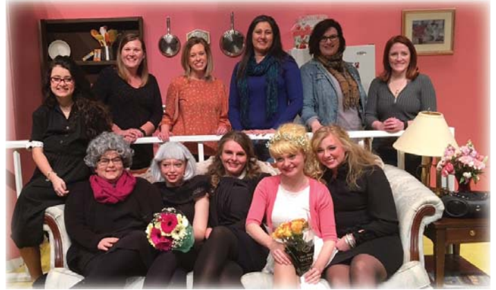
The 1992 cast of Steel Magnolias joined the 2016 OHHS cast on stage for a photo after the February show!

cheerleader, Thespian or stage crew member. Help us honor the stars who graduated from our stage and do your part to renovate our facility for our future Highlander talent.