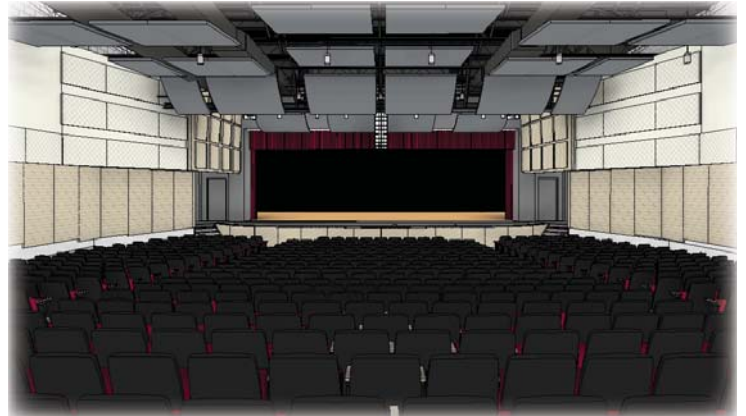
Sneak peek rendering of what the renovated Lone Holt Auditorium at OHHS will look like. Get more information and see pictures of the ongoing construction at www.oakhillsauditorium.com .

Our annual appeal is critical to our continued success. We've seen that donors like you can make magic happen. Please make your tax-deductible gift today so we can wave our magic wand once again. Thank you for your consideration and generosity. Your donation is essential to ensuring our young Highlanders graduate with an excellent education and state-of-the-art facilities.